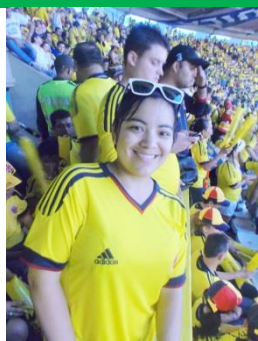
1Drenched, inside Colombia's soccer stadium (cheering for Ecuador)!