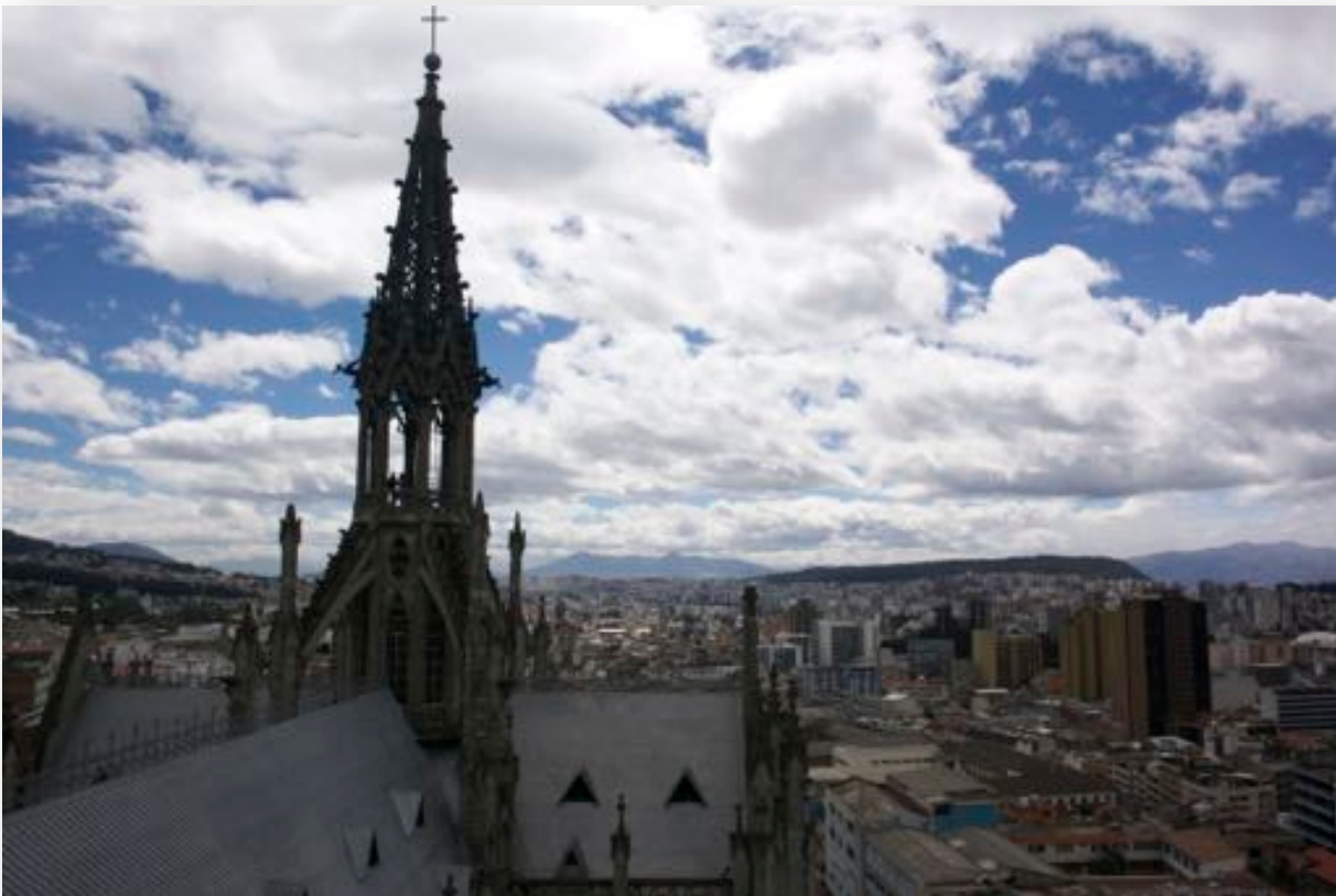
Basilica in Quito