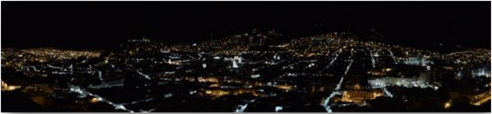
Quito at night.